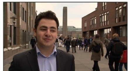
Luke 6 I wanted to be ...