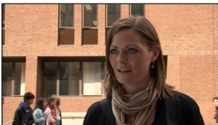
Elizabeth 4 I wanted to be ...