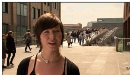
Fawn 5 I wanted to be ...