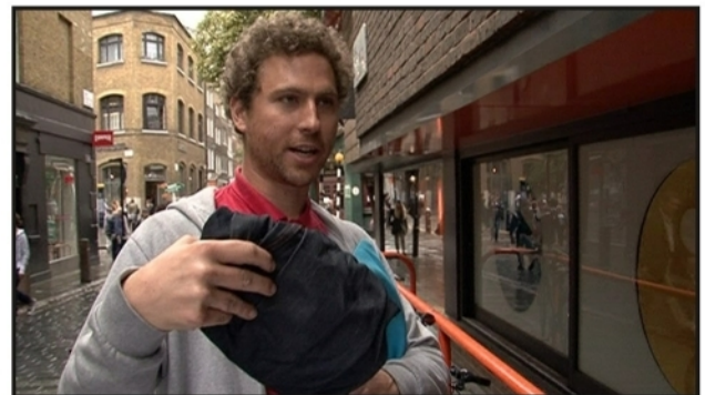
6 A laptop and jeans.