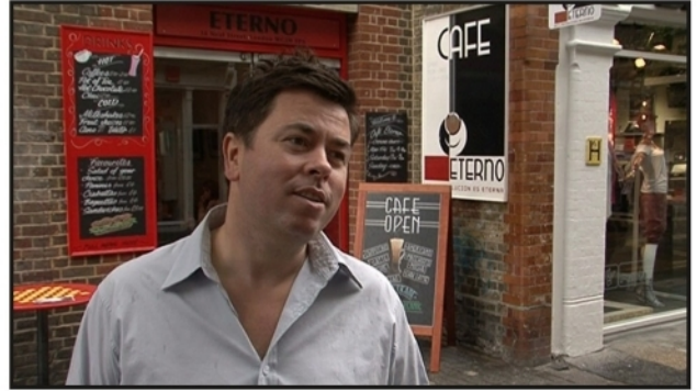
2 I like jeans / a jean and a T-shirt.