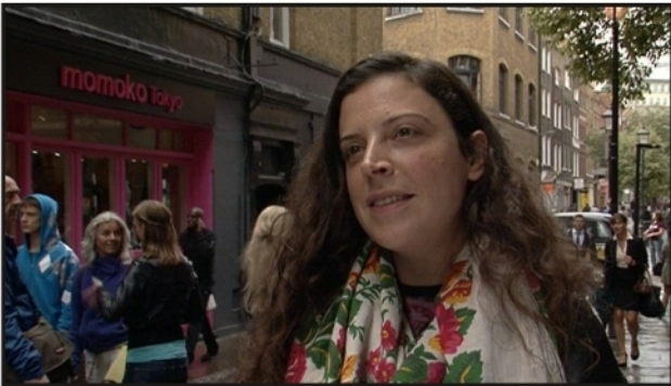
5 I really like / like really colourful designer clothes.