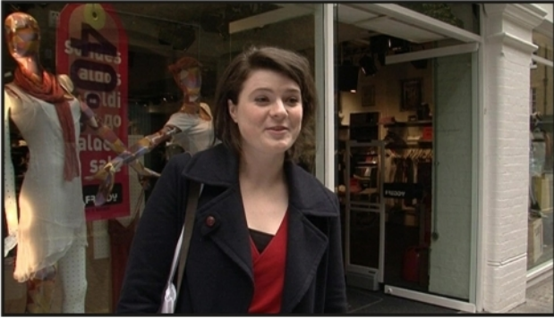
1 My favourite clothes / cloths are my running shoes.

5 The people in the pictures talk about their favourite clothes. Watch the video podcast from 2:06 to 2:57 again and underline their answers to complete the sentences.