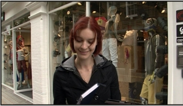
1 My wallet, my diary and my phone. F

3 What's in your bag? Look at the people below and read the answers. Check new words in your dictionary. Then watch the video podcast from 0:27 to 1:46 again and write true (T) or false (F) next to each answer.