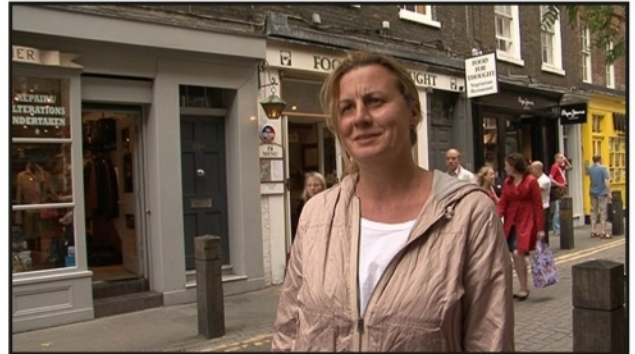
4 I like / My favourite clothes are black and white clothes.