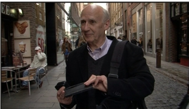
5 A camera, a notebook and a pen.