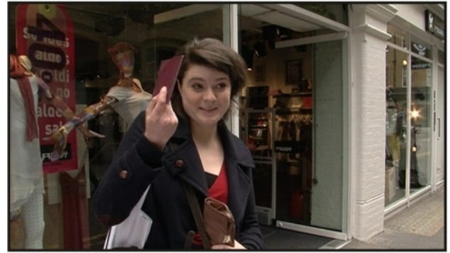
2 My wallet, my passport and my phone.