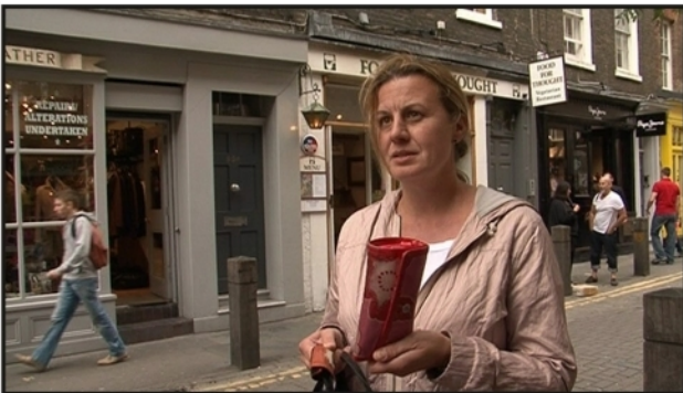
3 My purse and my sunglasses.