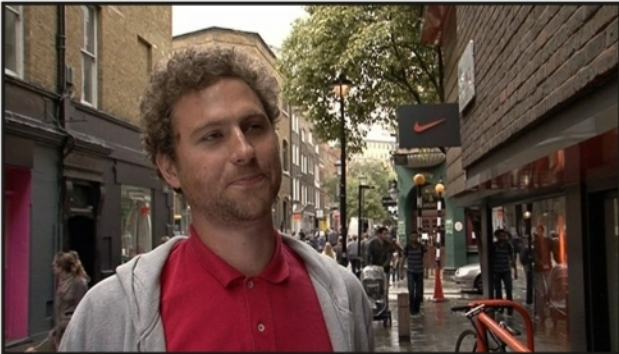
3 My favourite clothes are jeans, T-shirts / a T-shirt and hooded tops.