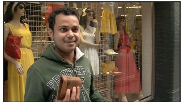
4 My mobile and my keys.