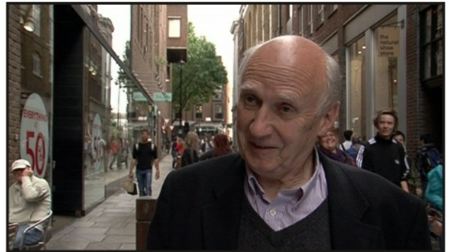
6 Well, I like this / these jacket.

Glossary: colourful = bright colours, e.g. yellow, blue, green; designer clothes = clothes by famous designers, e.g. Versace, Armani