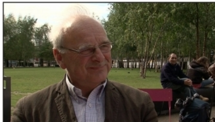
5 We go to _____ a lot of concerts and opera.