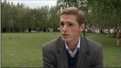
1 I go to plays quite often .