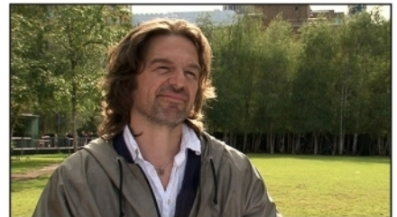
6 I go to concerts and films in London _____ I don't go to plays.

B Watch the video podcast from 2:03 to 2:57 and check your answers.