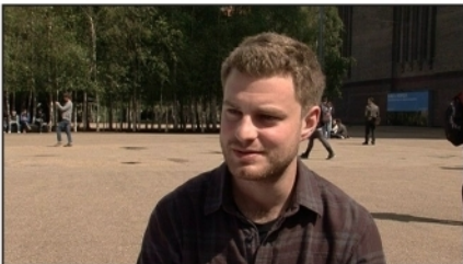
4 I go to a lot _____ concerts.