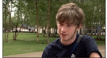
3 I go to _____ lot of concerts, like mainly rock music.