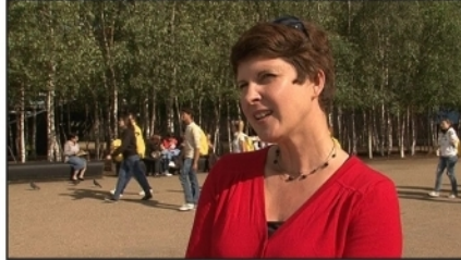
2 I go to the theatre a _____ .