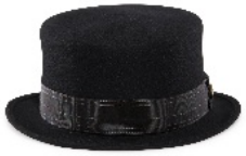
Hat – Hats