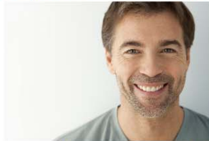
I am happy a lot.

Used with nouns to form phrases with quantity, amount, or degree: