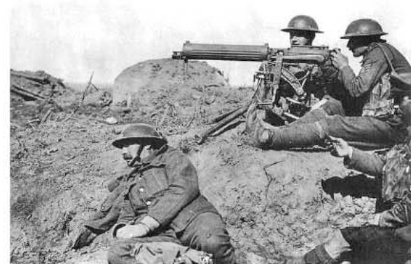
In the 1900's there were many wars.