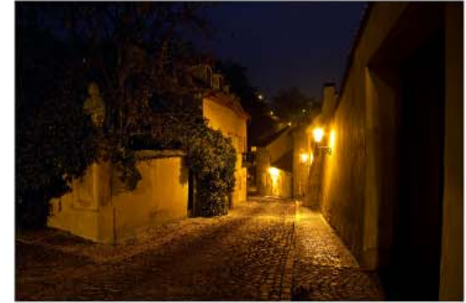
The day is short.