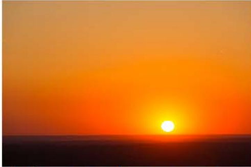
The sky is orange.