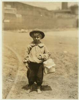
I looked so funny in the past.